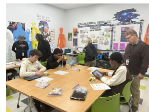
Coding at Connections